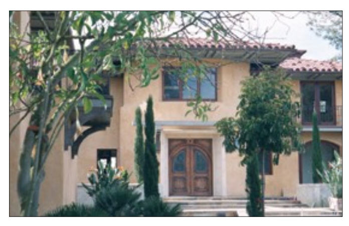
La Jolla, California

ArcusStone Products offers a fully integrated and color coordinated system of crushed limestone coatings and plasters, with the durability and finish of quarried stone. All products are installed exclusively by trained Applicators and Stone Artisans.