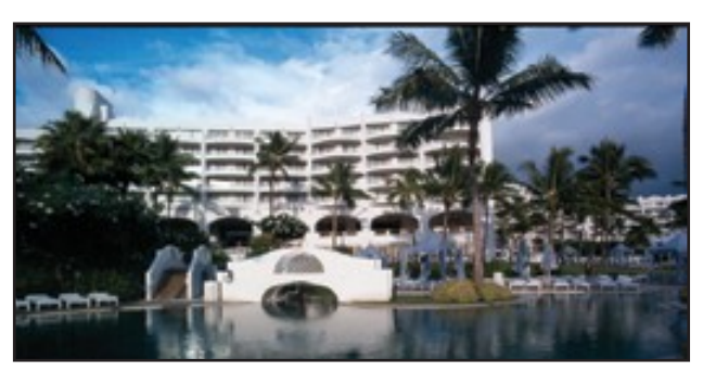
Kea Lani Hotel & Villas, Maui, Hawaii

ArcusStone Products offers a fully integrated and color coordinated system of crushed limestone coatings and plasters, with the durability and finish of quarried stone. All products are installed exclusively by trained Applicators and Stone Artisans.